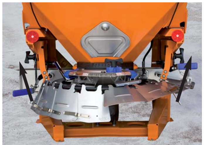
Separate spreading pattern limitation left and right

The patented AXEO "CDA" spreading concept consists of the spreading disc with eight spreader vanes and a speed of 230 r.p.m., together with a large and intelligently-shaped metering slide opening, located in the rotating hopper base. This well-designed system achieves even lateral and longitudinal distribution with steeply falling-away spreading flanks, a so-called trapezoidal spreading pattern, even at high working speeds.