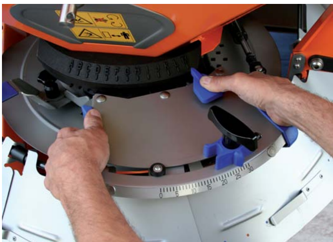
CDA setting centre - operating terminal