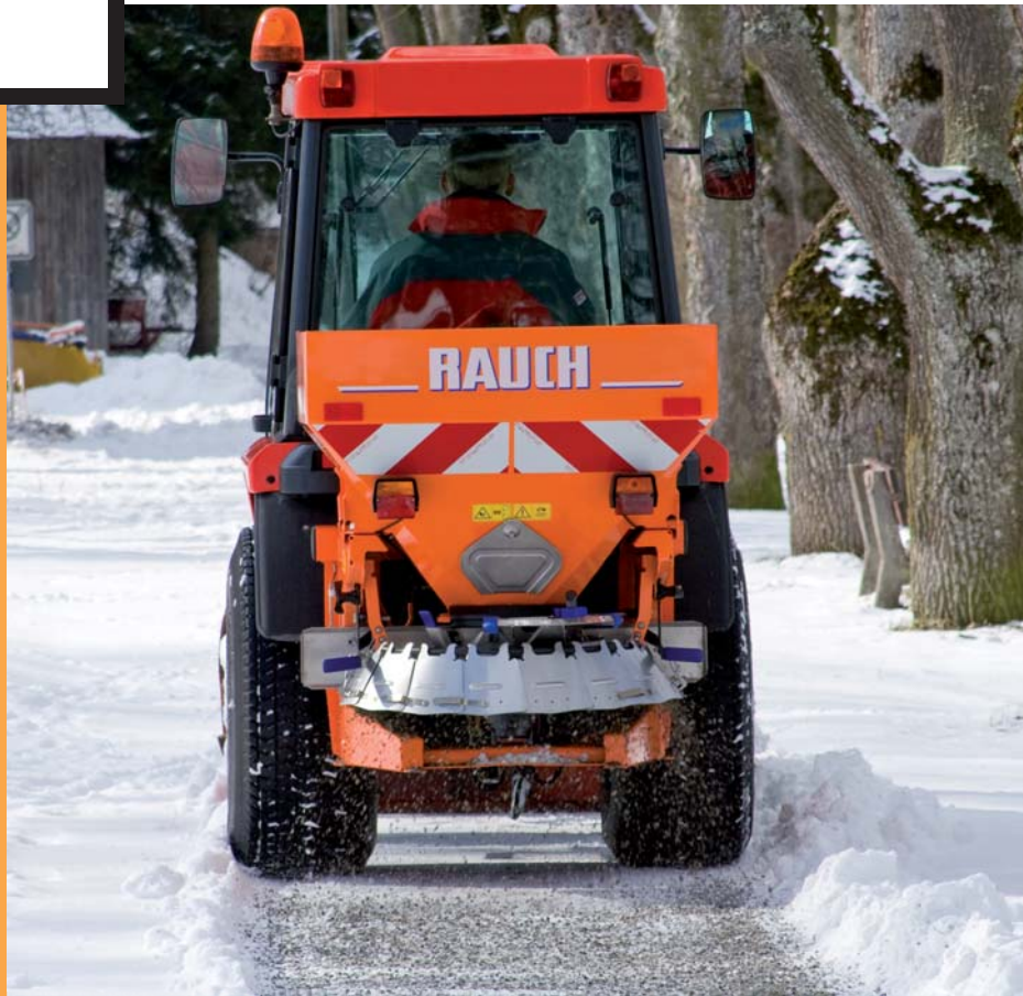
AXEO 6.1 up to 1000 kg payload