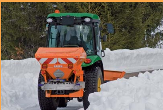
AXEO 2.1 up to 800 kg payload

The AXEO series fulfils all the requirements of a modern professional winter service: precision, high levels of operational safety, a long service life and maximum flexibility in working width.